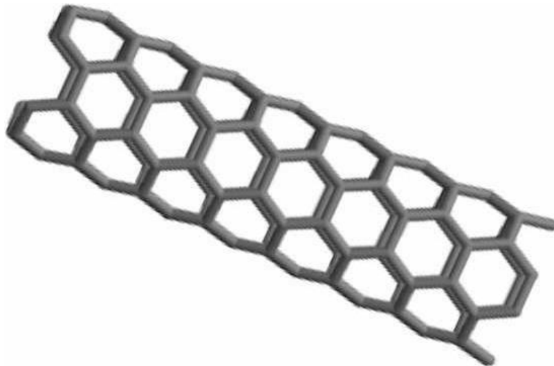
Figure 1. The 3D Lattice of Armchair polyhex nanotubes TUAC_6[8,7] .

The aim of this section is to obtain a closed formula of ABC_5 of general representation of armchair polyhex nanotubes TUAC_6[m, n]